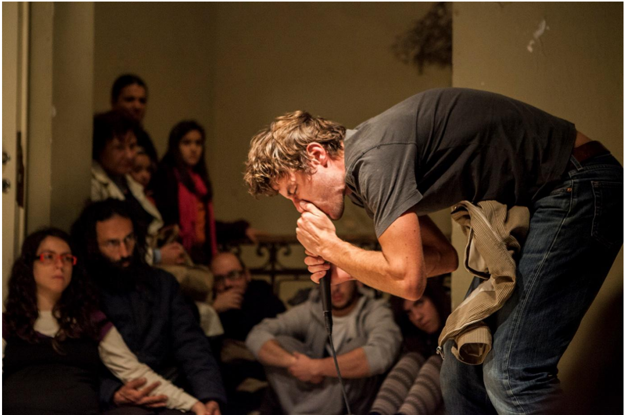
Contemporary art biennial of Thessaloniki, Greece, November 2013