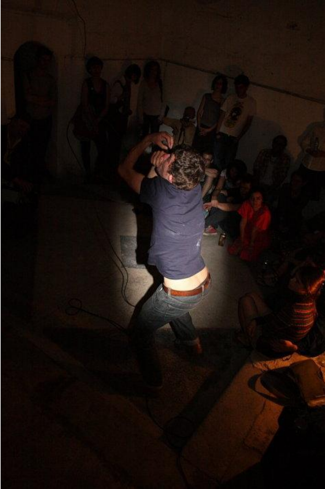
Art Today, ancient turkish baths, Plovdiv (bg), June 2010